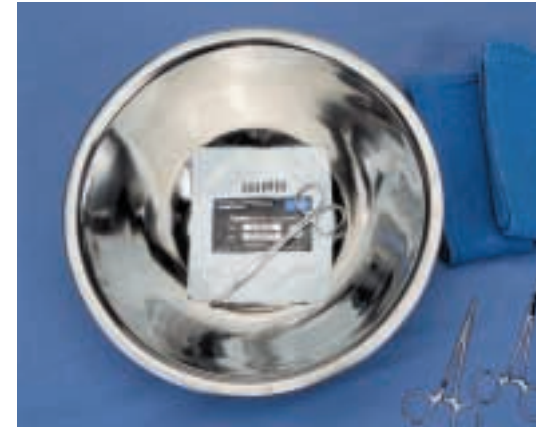
Figure 4 Place inner foil pouch into sterile basin.

Sterile basin method: Unopened foil pouch should be placed in the sterile basin