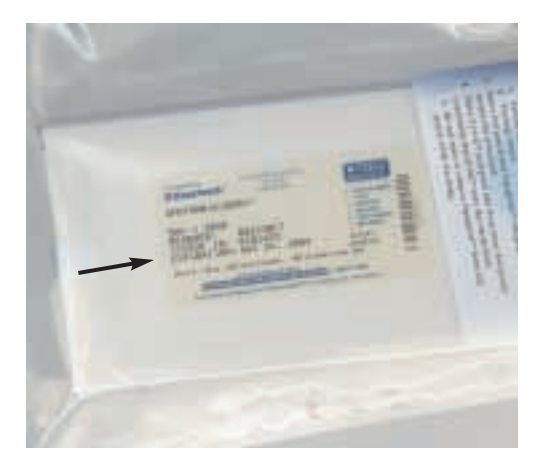
Figure 1 Verify expiration date prior to opening.