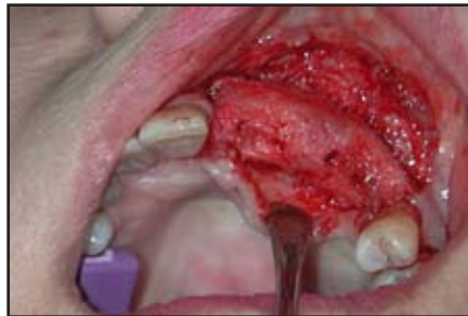
FIG. 11: Osseous ridge marked for implant placement preparation, 4 1/2 months post-grafting procedure.