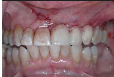
FIG. 8: The patient's existing flipper was modified with the addition of teeth #11 & #12 and was relieved to keep all compressive forces off of the graft, thus ensuring no compromise to the graft's vascularity.