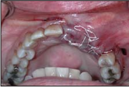
FIG. 7: Passive primary closure was achieved utilizing a Gore™ non-resorbable suture.