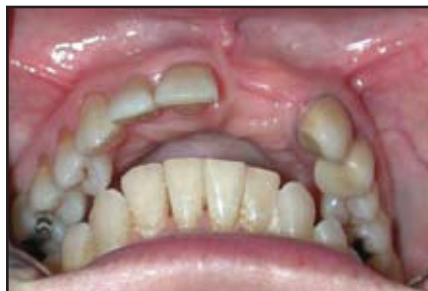
FIG. 2: 4 month post-extractions and healing of teeth #9 and #10.