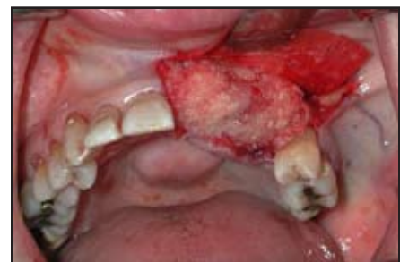
FIG. 6: A buccally fixated collagen membrane was utilized to isolate and prevent soft tissue ingrowth.