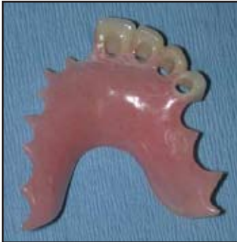
FIG. 10: The patient's flipper was utilized as a surgical stent for implant placement.