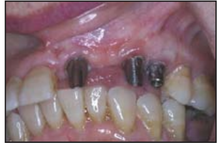
FIG. 15: Abutments in place.