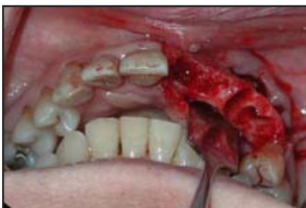
FIG. 4: Occlusal view of the osseous irregularities.