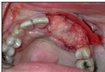
FIG. 5: A 2cc block of Regenaform was utilized to graft the surgical site.