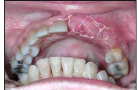
FIG. 9: Two weeks post operative healing.