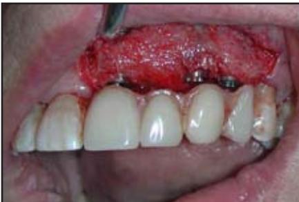
FIG. 13: Facial view of implant placement.