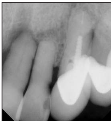
FIG. 1: Pre-treatment radiograph of hopeless teeth #9-10.

A 73-year-old female presented with a chief complaint of pain on chewing on tooth #9. Examination revealed that teeth #'s 9-12 had a hopeless prognosis due to advanced periodontal breakdown. The recommendation for extraction of teeth #'s 9-12, ridge augmentation, and an implant reconstruction was initially declined. Alternatively, the patient chose to have teeth #'s 9 and 10 removed and a transitional removable partial denture fabricated. At four months of healing and wearing the removable appliance, the patient was unhappy and requested the proposed fixed implant therapy. The patient's therapy included extraction of teeth #'s 11-12, guided bone regeneration therapy using Regenaform moldable allograft paste and three (3) implants.