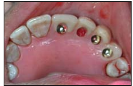
FIG. 12: Three Steri-Oss™ implants in place.