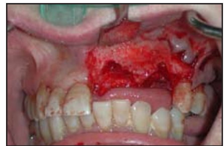
FIG. 3: The extent of osseous destruction is evident at the time of grafting procedure.