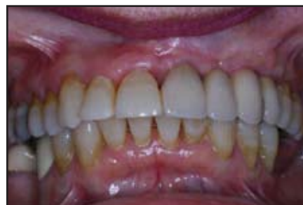
FIG. 16: Two year post surgical restoration.

Gore™ is the registered trademark of W.L. Gore & Associates, Inc.